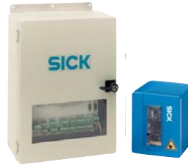
OPS with OTS